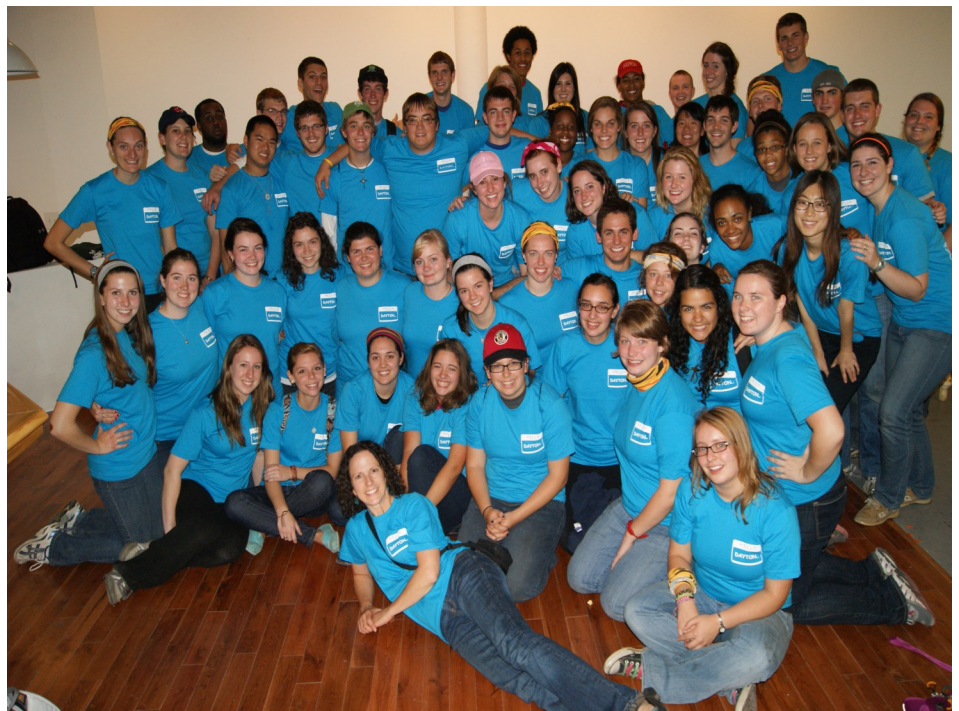
REAL Dayton Participants